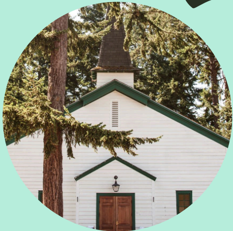
At the Chapel in Fort Worden

December 2024 thru April 2025 (Last Saturday of every month)